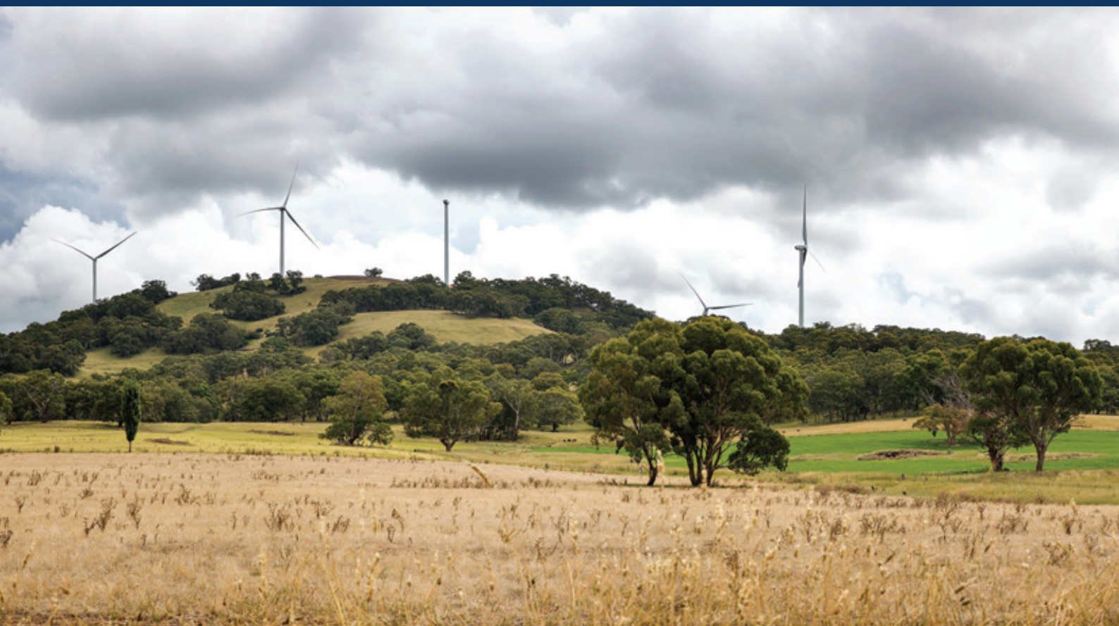
View of White Rock Wind Farm turbines in various stages of installation from Jenkins Road

Welcome to first combined White Rock Wind Farm and White Rock Solar Farm newsletter. This newsletter provides information and updates about both projects. Further newsletters will be produced at regular intervals as the projects progress and milestones are achieved.