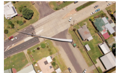
Wind turbine blade navigating the turn from New England Highway to Heron Street in Glen Innes.

Transportation of wind turbine components into the local area commenced late last year and will continue until mid- 2017. Two to three turbines will be delivered to the project site each week.