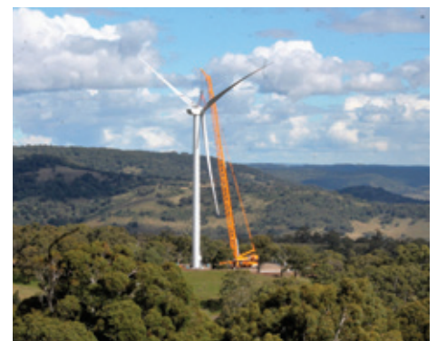
Turbine installations underway.